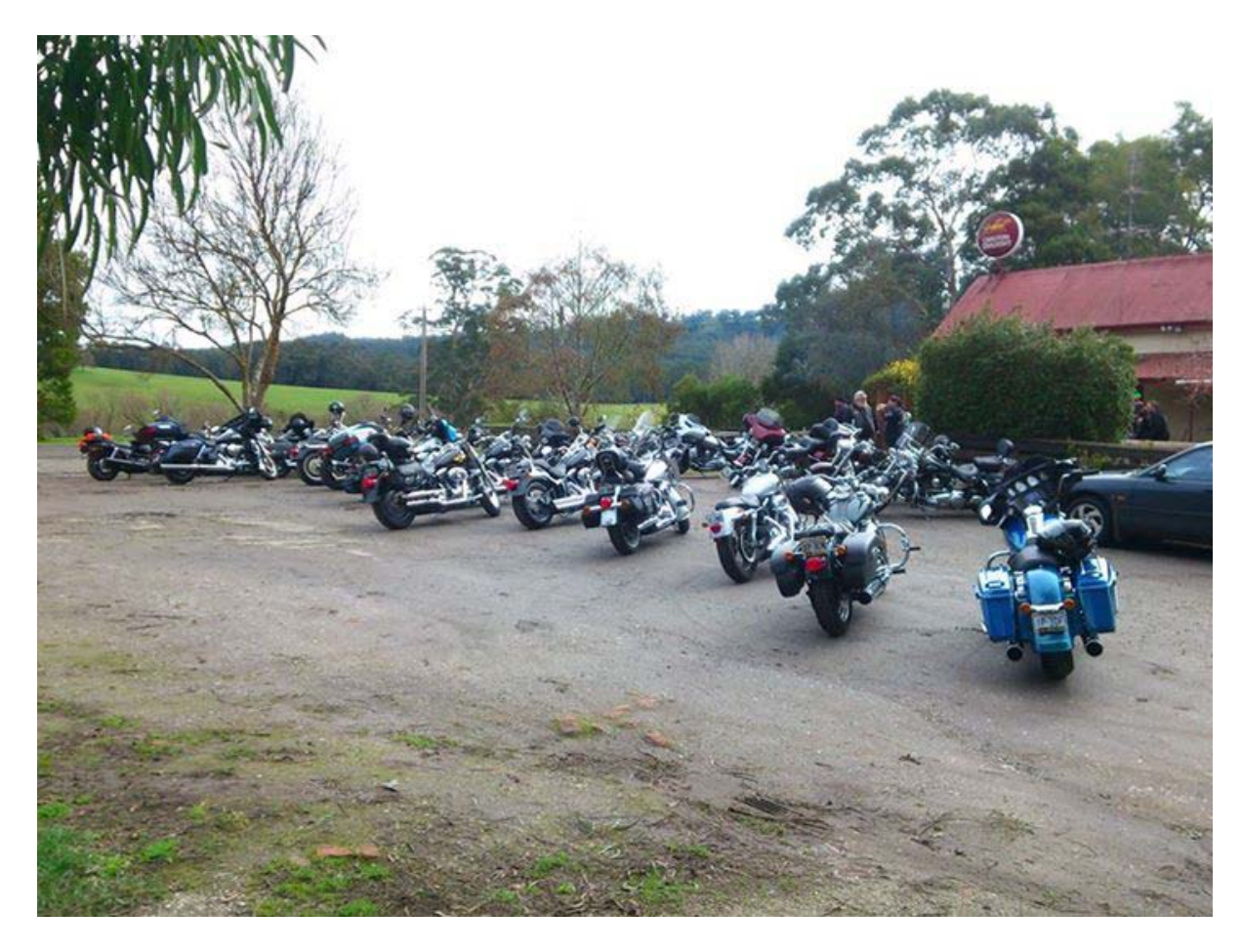
Harley Davidson Club from Geelong – August 2015