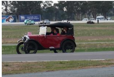
RACV Benalla Historic Vehicle Tour