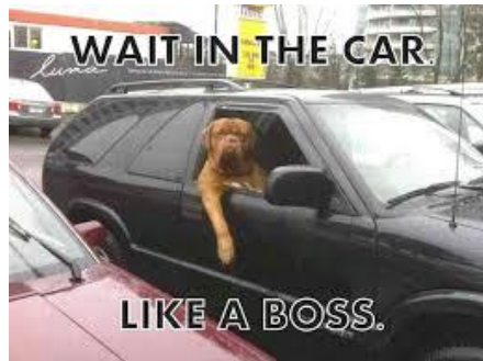
Take my car deal with me first!