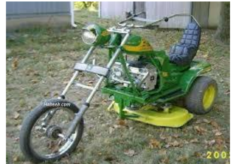
Who wants there lawn mowed.