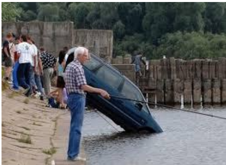
Why let some ones misfortune get in the way of a day's fishing!