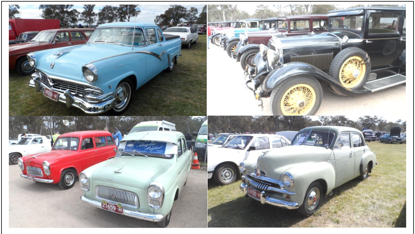
Some of the vehicles that gave the Editor pleasure at The Federation Picnic at Marong. August 30 th 2015

Remember: if you want something done, ask a busy person.