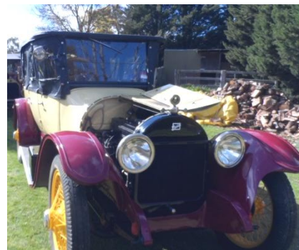
A very early 2 cylinder Peugeot,