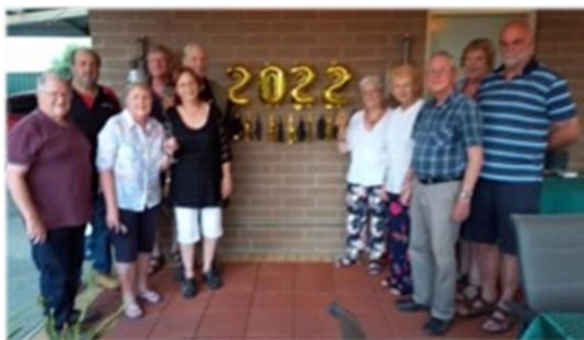
New Year’s Eve