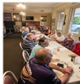
Parma Night (Colac East Hotel)