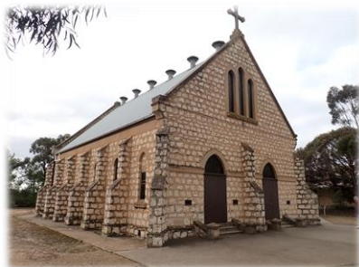
The Pella Lutheran Church