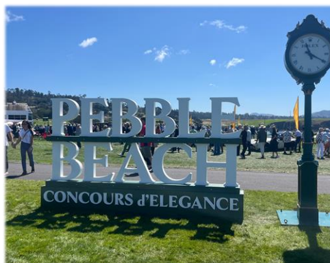
Pebble Beach – a stunning Sunday