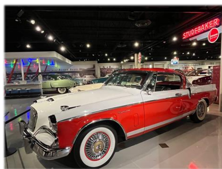
The Studebaker Collection