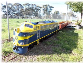
Train at Kerang