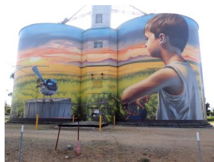
Rupanyup Silo Art