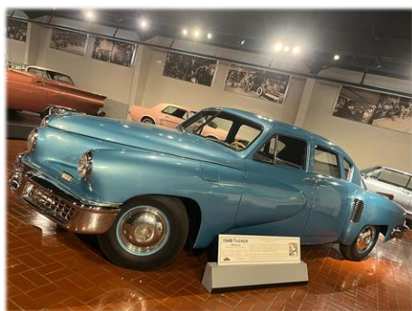
Tucker No. 47 at the Gilmore Museum