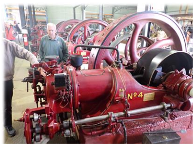
Dunmunkle Sump Oilers Murtoa