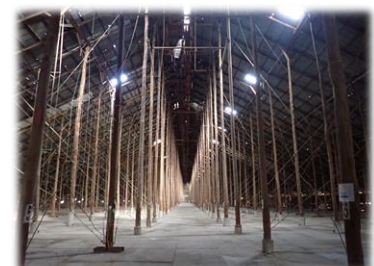
The Murtoa Stick Shed

We all enjoyed a farewell breakfast at the Horsham RSL on Saturday morning.