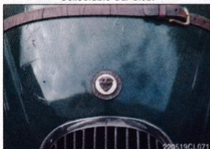
RICH HISTORY: The Jaguar XK120 has a fascinating origin story dating back the Second World War in England.