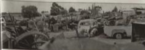
A collection of not well-organised cars and parts.

I know people in their seventies who are building bigger sheds to house their restoration projects and their lifetime accumulation of parts. This does not seem smart to me at that stage.