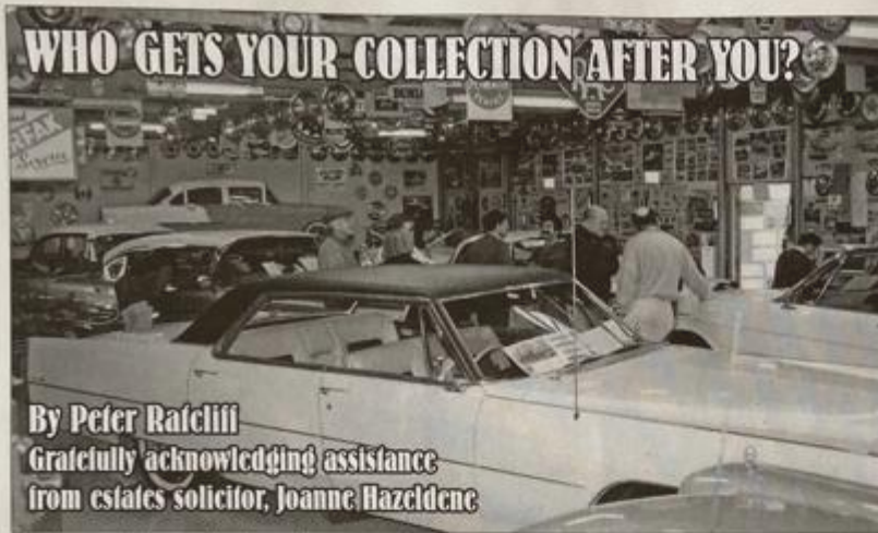
A well-organised car collection and museum. All photographs used in this feature are to illustrate examples discussed, most have been taken over the past 40 years.

We are all going to die in the end. What arrangements have you made for your 'stuff'? Many of us are in the situation where our families will not be interested in what we have collected. If there is any interest from them, it may be due to perceptions of untold riches coming from the sale of your stuff. In any case, your family (or the executor of your will) will give you their heartfelt thanks if you leave them some sort of guide to help them dispose of it. A discussion while you are still here would be a good start.