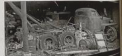
WWII military Studebaker 6WD in undercover storage

They are still dreaming of restoring several cars from the numerous heaps of deteriorated iron oxide in their yards and sheds. Some of them have not realised that the inspiration to spend every moment in the garage eventually dwindles away. Remembering the old advice to always buy a car in the best condition you can, perhaps an older person should not be restoring any car that is not a really special model. Do you have the time?