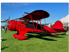
All things vintage