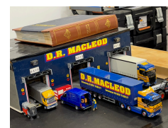
Truck swap meet