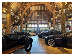
Aston Martin Trust