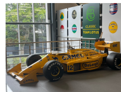
Lotus factory tour