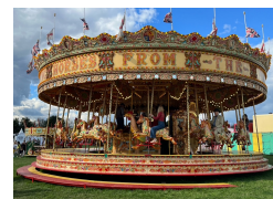
Steam driven carousel

TRAVELLING TO ENGLAND EVERYTHING AUTOMOTIVE