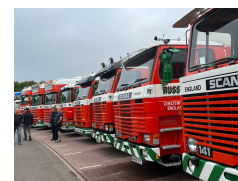
.....and truck show