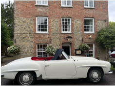
Classic Car drive