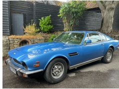
Classic Car drive